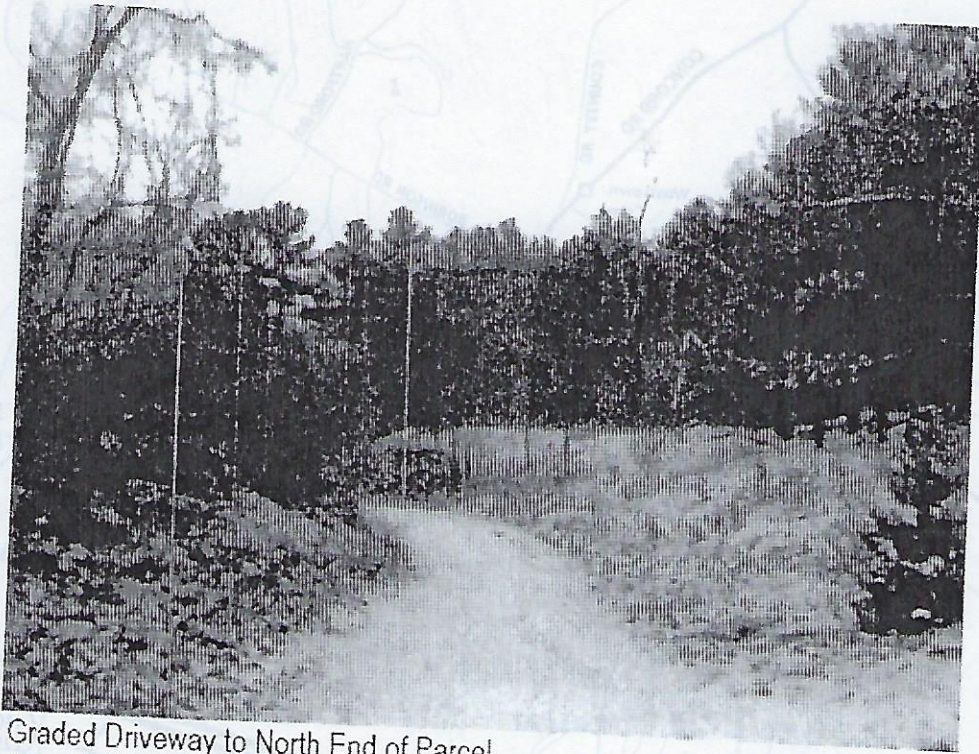
Graded Driveway to North End of Parcel January 6, 2017