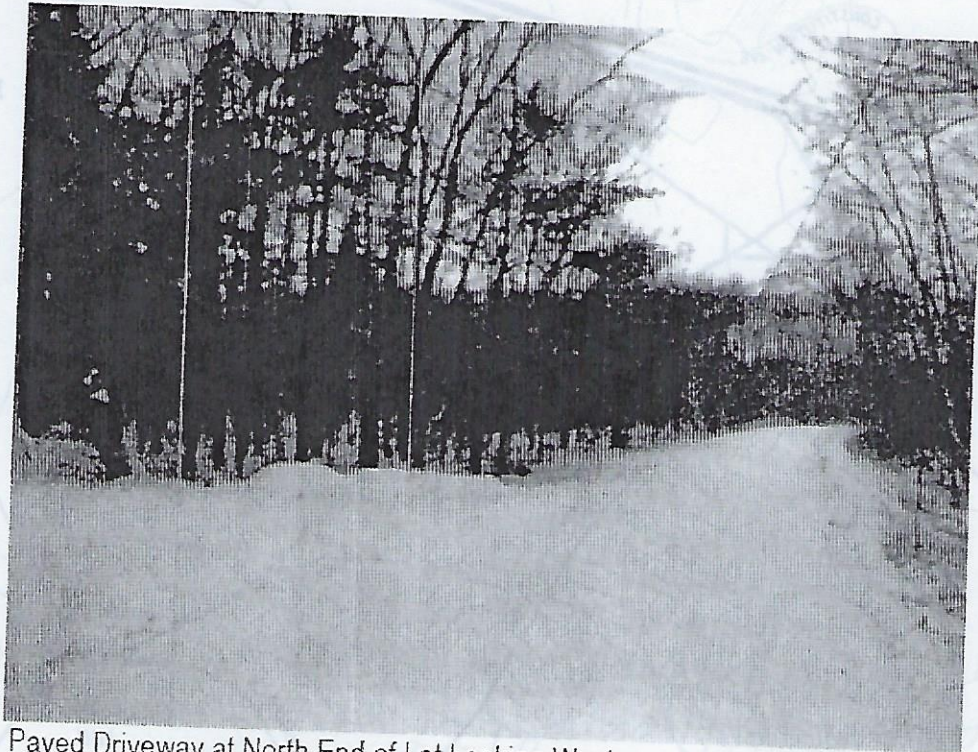
Paved Driveway at North End of Lot Looking West January 6, 2017; Photographed by Kenneth Croft